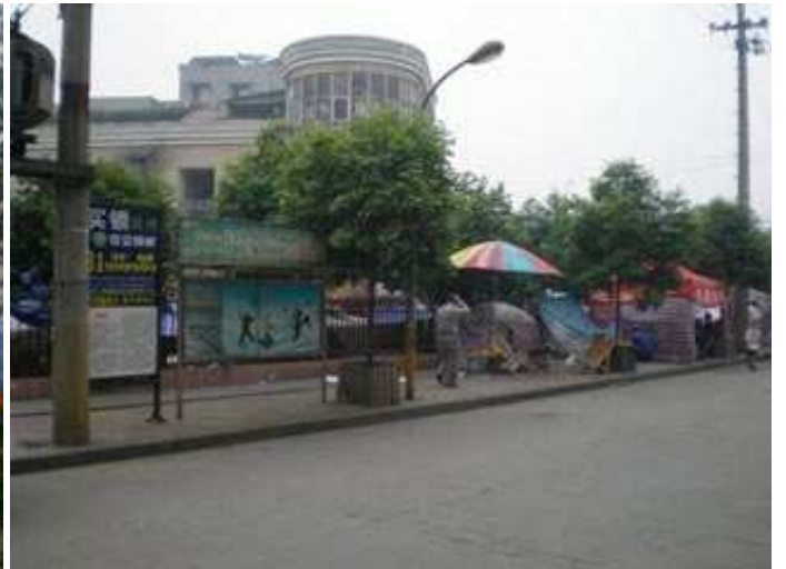
The road behind my home became a maze of tents after the first false alarm about a huge aftershock. In my housing district the school courtyard was converted into a tent city...and all along this sidewalk sleeping tents were erected in just a few hours.