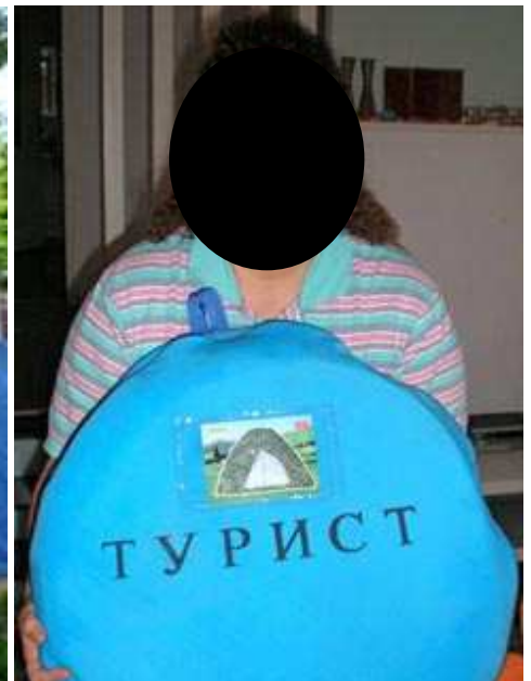
Roadside tents are finally coming down. In outlying areas we were not able to provide dome tents like the one I'm holding, but we did provide tent material (like the red/white/blue stripe in photo) to shelter approximately 500 people.