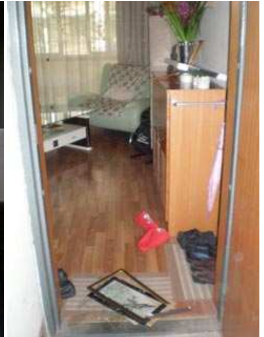
Left: Just before the quake, I noticed this "Chinglish" sign posted at the entrance of a building. Right: Not much damage at my house, just some broken glass at the entrance.