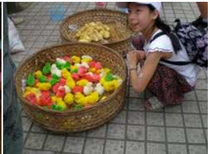
Teaching about sharing what one has with others. My friend's daughter checking out the "chickies." I'm not sure why they're dyed such bright colours. Can you tell it's ducks in the second basket?