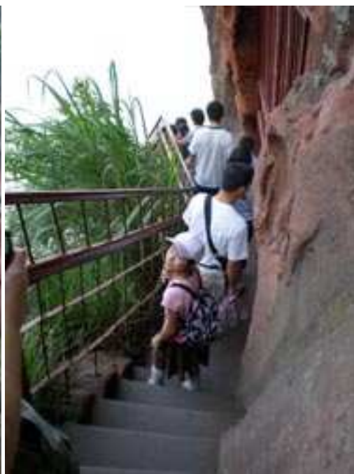
A long, hot, sticky morning of hiking up and down, down and up steep steps.