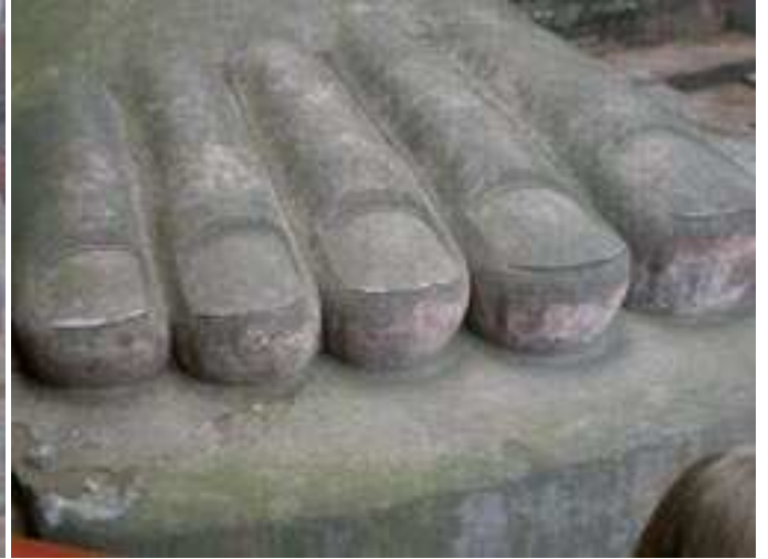
Hands and feet that cannot move...and if they could, wow! I'd hate to try to find shoes that fit!