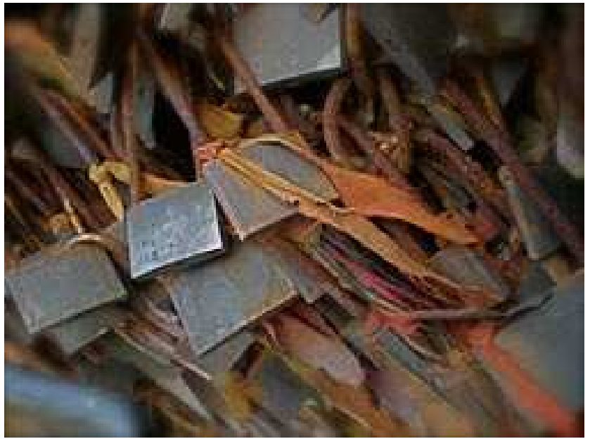
Tradition states these locks are to lock in happiness for the person whose name is engraved on the lock...but be sure to throw away the key. My personal advice would be, "if you want to be happy, stay away from the steps."