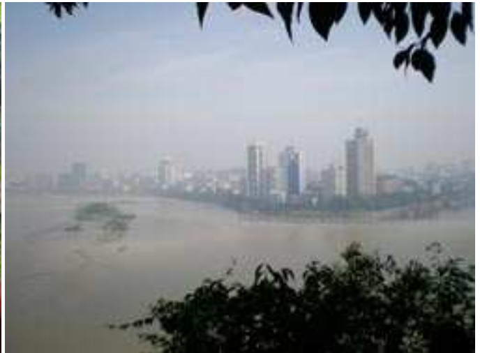
View of the giant Buddha's head up close...The giant Buddha's view of LeShan.