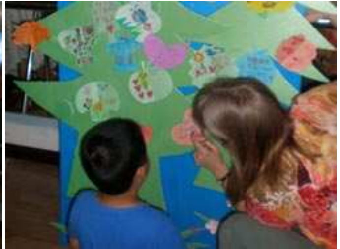
Special project for earthquake victims at the school.