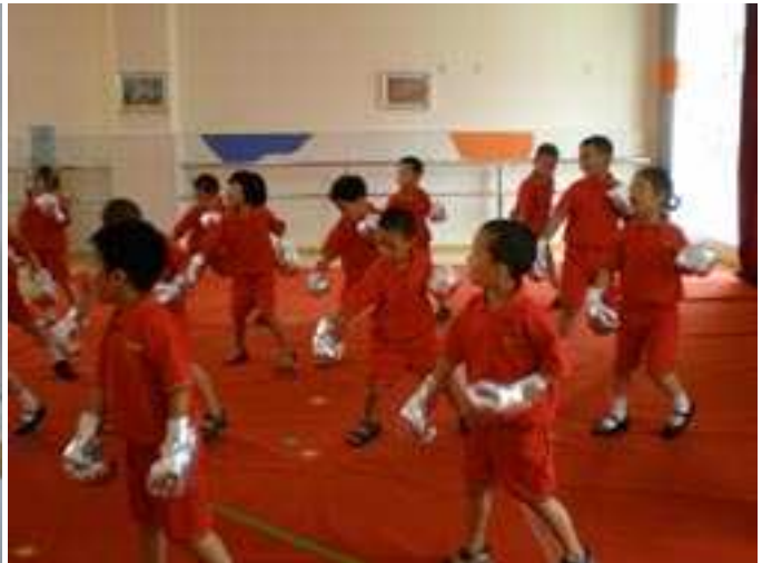
Heading out to practice – very professional. One friend said the silver gloves (morning exercise routine) reminded her of Jiffy Pop!