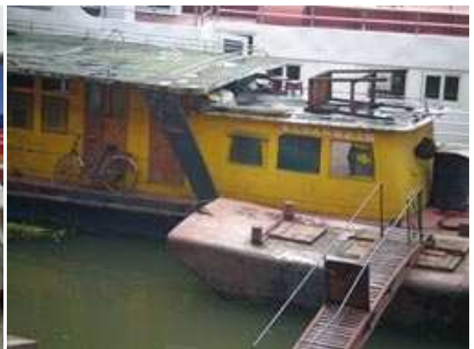
Chinese version of a food court – outdoor, of course. Typical scene at the water's edge.