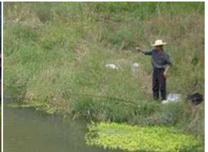
In my mind, the bridge at left joins "thousands of steps" to other "thousands of steps" – simple as that! Fish anyone?