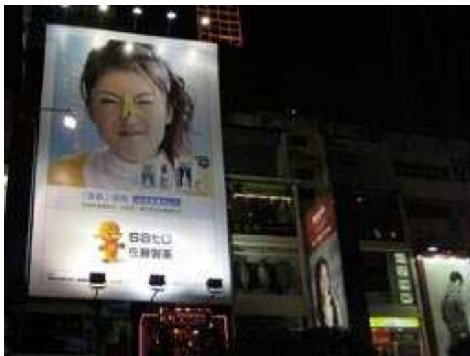
It looks like a dragon, but it's a lion. The lion and accompanying cymbals and drum players paraded through stalls at a famous outdoor market in Hong Kong. Shop owners gave the lion money for good luck in 2009. This billboard cracked me up! Not sure what it's for, but it's funny to me.