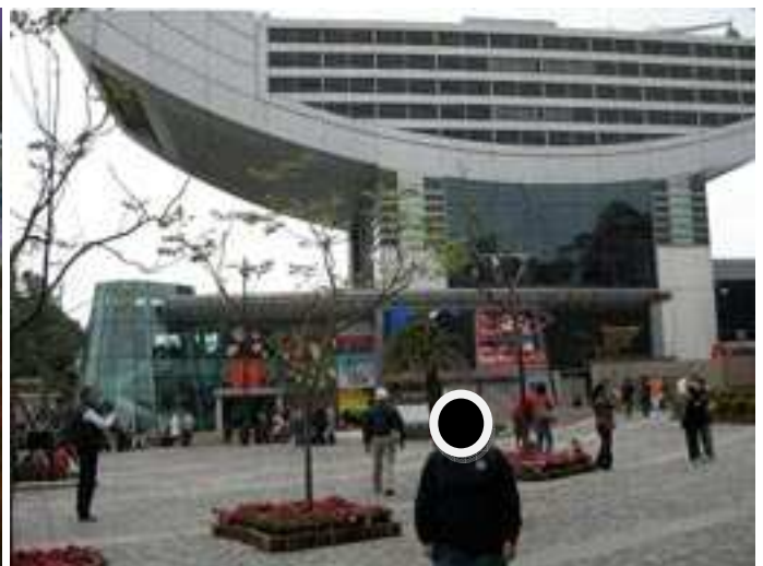
All of Hong Kong's tourist spots Photoshopped into one picture. Behind me is the "Rice Bowl" building.