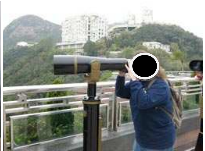
Checking the harbor from the Peak. We rode the trolley straight up (like a Disney ride) and took a bus down.